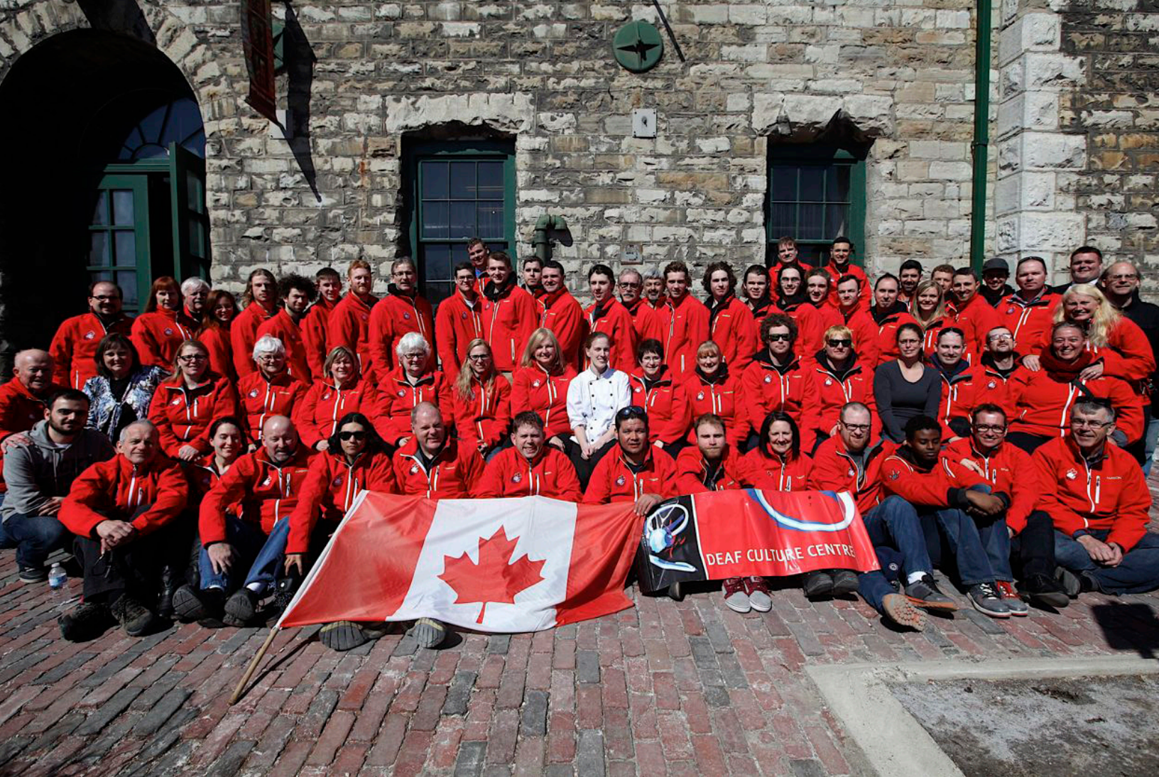
Photo of the 2015 Canadian delegation at the Deaflympics in Khanty-Mansiysk in Russia